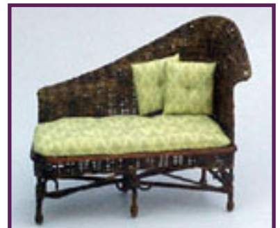
WICKER SETTEE £56