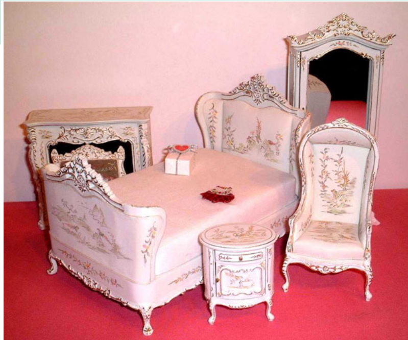
FRENCH STYLE HAND-PAINTED BEDROOM SUITE - 6 PIECE