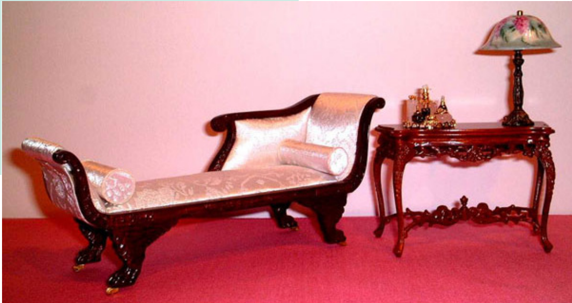
BROCADE CHAISE CONSOLE TABLE