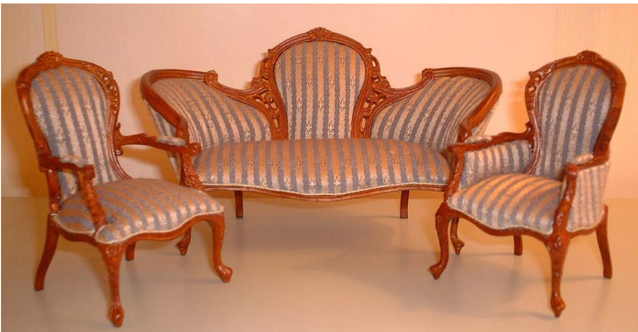
LOCUST HILL SUITE - BLUE £150