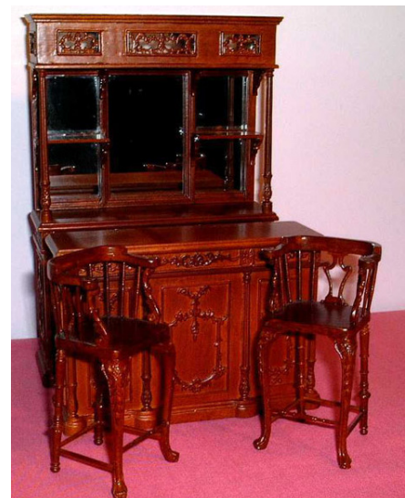
NEWCASTLE BAR - 4 PIECES £190.60