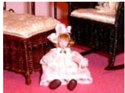
DOLLS DOLL £39.95