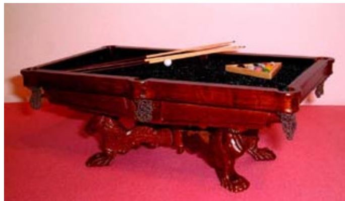
CARVED LION POOL TABLE £95.55 TO ORDER