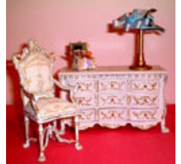
HAT VARIOUS STYLES