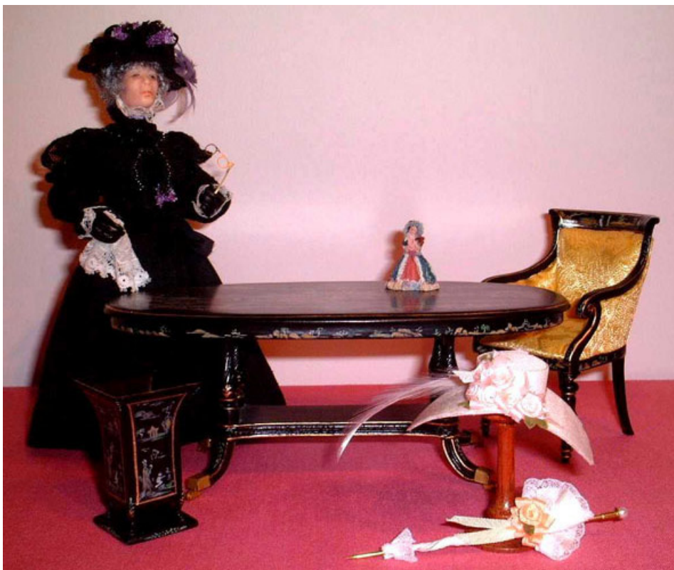
LADY £ DINING SET £158 WITH 4 CHAIRS CACHE POT £31.95 FIGERINE £11.50 HAT & PARASOL £27.50