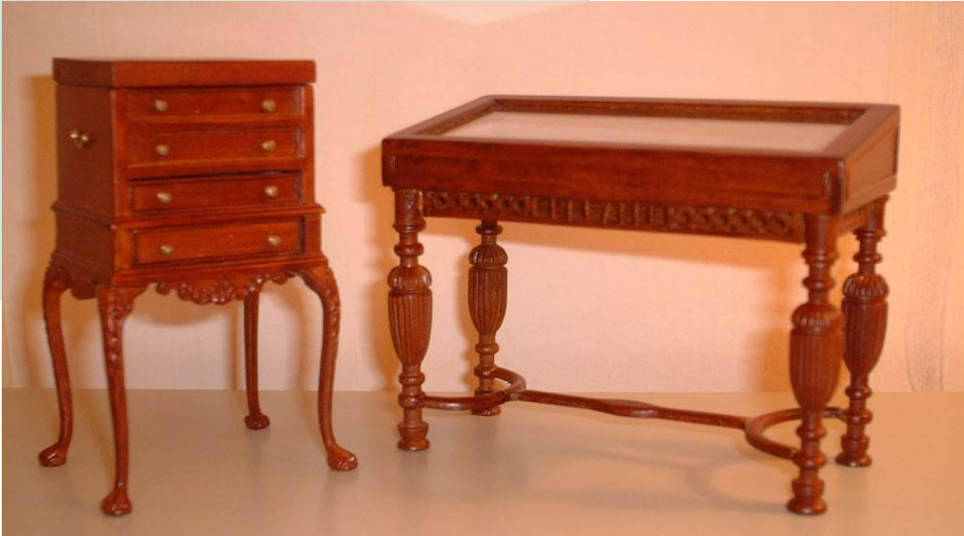
POLK SILVER CHEST £49.50