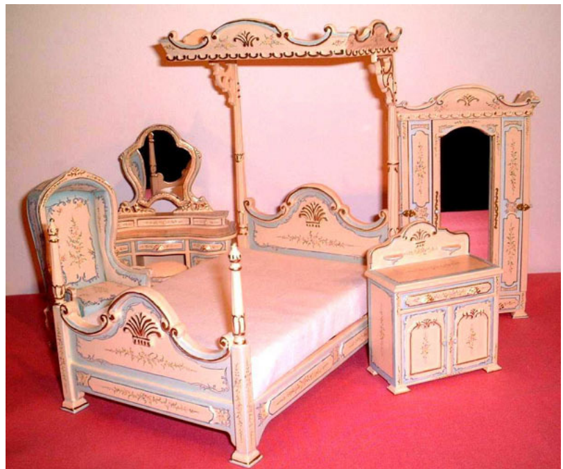
BELMONT BLEU BEDROOM SUITE - 6 PIECE