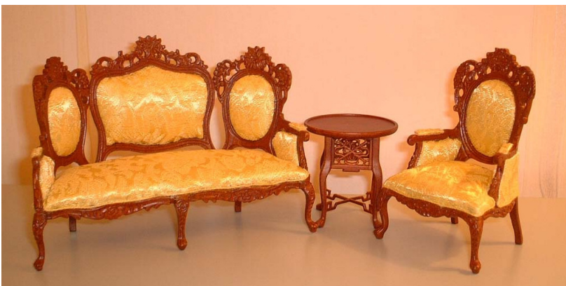
WISTERIA SOFA AND CHAIR - GOLD