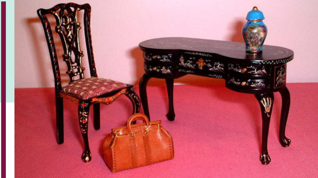
CHINOISE DESK CHAIR