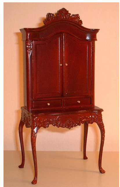
LIMITED EDITION LADY'S CABINET